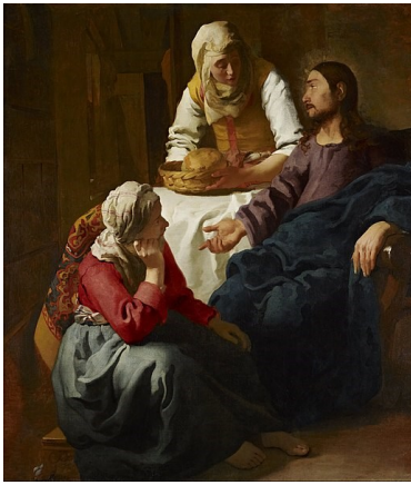
Christ in the House of Martha and Mary Johannes Vermeer (ca. 1654-1656)